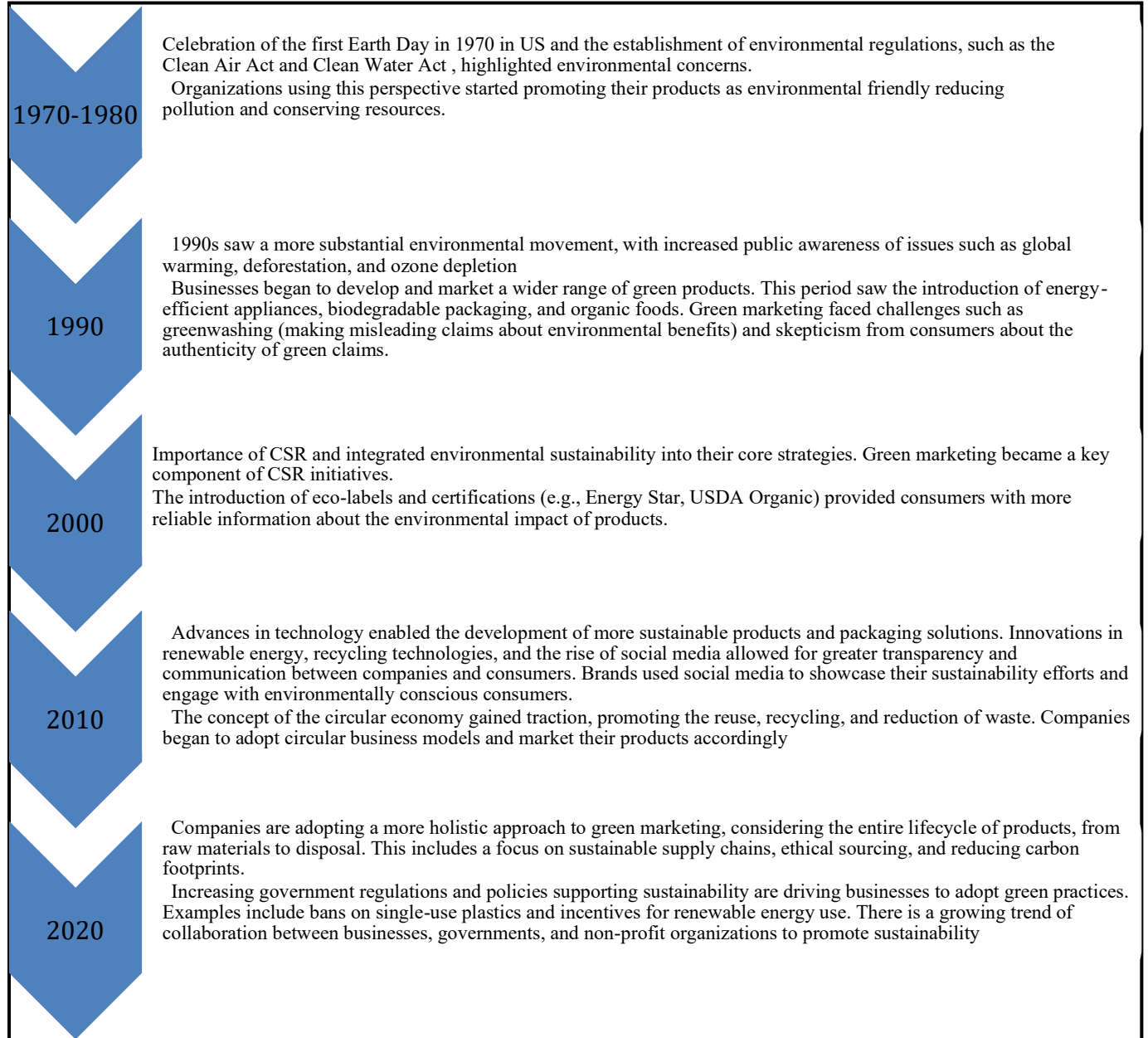
Fig:1 Evolution of Green Marketing