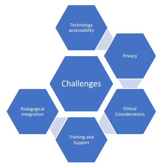
Figure 4 Challenges and Considerations

6.1 Access to Technology: One of the primary challenges is ensuring equitable access to technology, particularly in resource-constrained settings. AI-enhanced virtual laboratories often require robust computing infrastructure, high-speed internet connectivity, and access to specialized software and hardware. [13] Disparities in access to technology can exacerbate existing inequalities in education, limiting opportunities for students from underserved communities to engage with AI-powered learning resources. Bridging the digital divide and providing access to technology for all students are imperative for ensuring equitable access to AI-enhanced virtual laboratories.