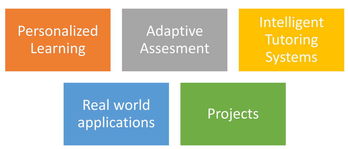
Figure 3 Role of AI in Informatics Education.

4.2 Adaptive Assessments: AI facilitates adaptive assessments in informatics education by dynamically adjusting assessment parameters based on student performance and mastery levels. Traditional assessments often follow a one-size-fits-all approach, failing to accurately gauge individual student competencies. AI-powered assessment systems, on the other hand, can generate custom quizzes, exams, and assignments tailored to each student's strengths and weaknesses. These adaptive assessments not only provide more accurate evaluations of student progress but also offer targeted feedback and recommendations for improvement, facilitating continuous learning and growth.