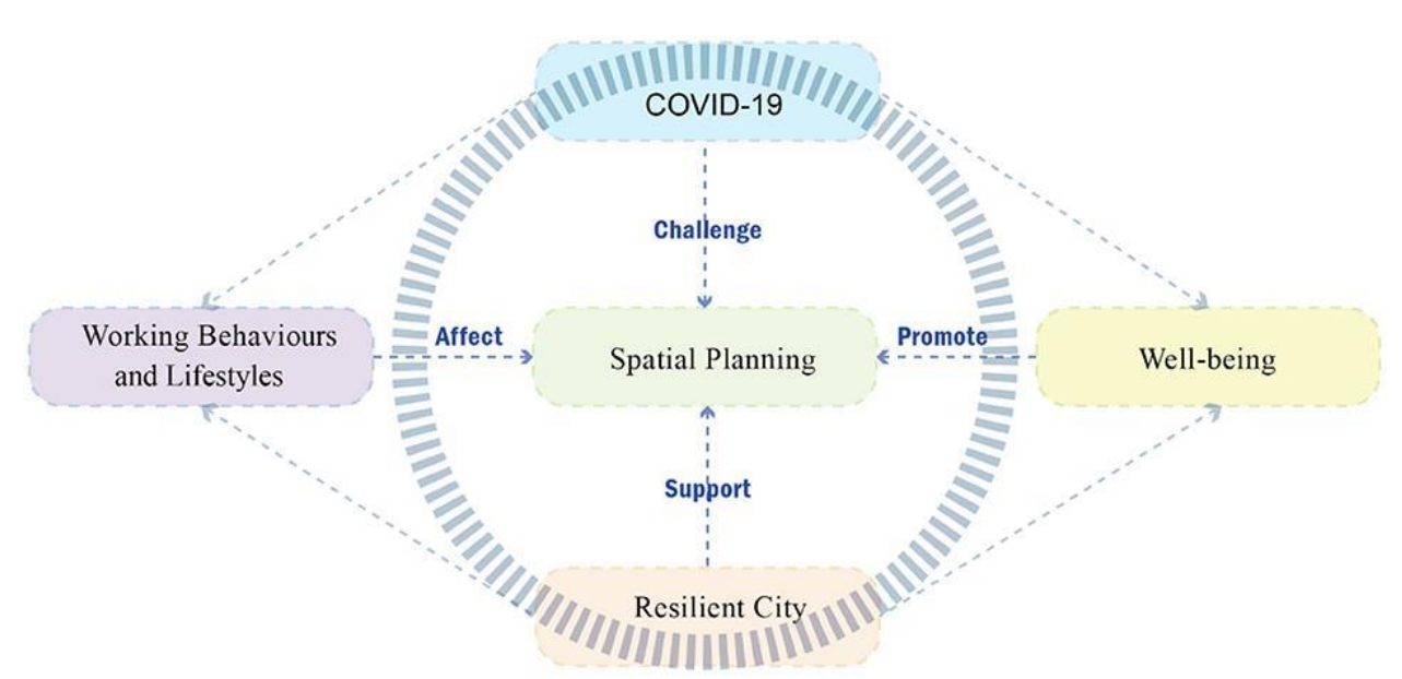
Figure 3: Suggestions for the betterment

The research excludes statistical details of each and every aspect of human behavior that is being affected.